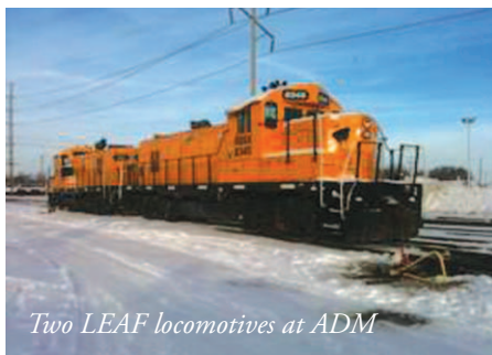
Two LEAF locomotives at ADM

As the world's population grows, so does demand for quality foods, feed ingredients for livestock, alternative